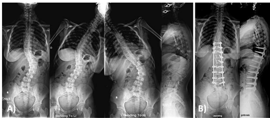
Figure 2. Female patient 16 years old with Lenke 5 c +. (A) Preoperative X-rays showing lumbar curve of 56° that was corrected to 41° and main thoracic curve of 28° that was corrected to 20° in side bending films, with thoracic kyphosis of 48°. (B) Two years postoperative X-rays showing posterior correction and fusion of the lumbar curve only from T9-L5 with lumbar curve correction to 10° and spontaneous main thoracic curve correction to 14° with thoracic kyphosis of 38°.