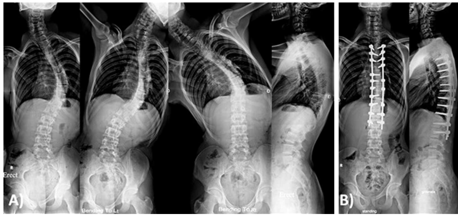
Figure 1. Male patient 17 years old with Lenke 1 a n. (A) Preoperative X-rays showing main thoracic curve of 50° that was corrected to 29° in side bending films with thoracic kyphosis of 40°. (B) One year postoperative X-rays showing posterior instrumentation from T4-L2 with main thoracic curve correction to 9° with thoracic kyphosis of 36°.