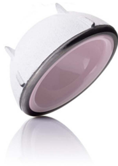
Figure 1. Ceramic-on-ceramic acetabular cup (CARGOS™ HAP Press Fit cup) with equatorial fins and tropical spikes.

A 32-mm diameter ceramic head was used in 35 hips (30.2%) and a 36-mm diameter ceramic head was used in 81 hips